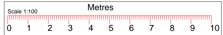
SHOP PLAN Scale 1:100